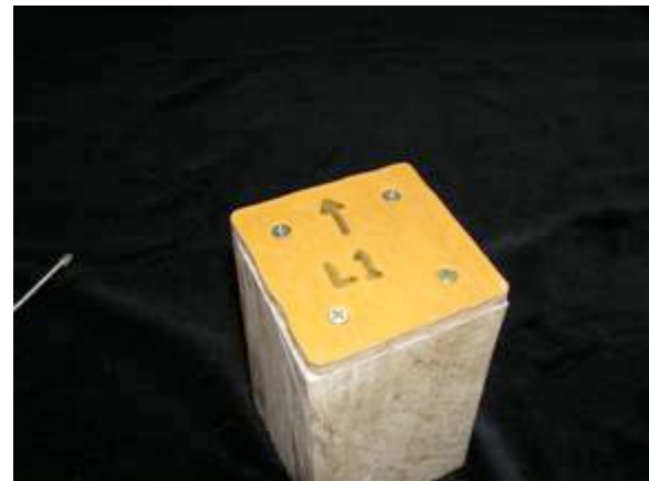
Screw on back, trim tails; you're done!