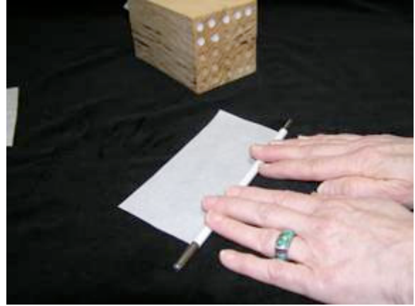
Roll the paper tightly around the rod