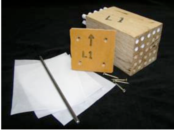
All you need for your own lined bee nest