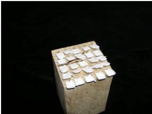
Bend over tails sticking out the back